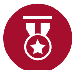
Military & Defense